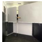
FAUTRAS TECH PARTITION