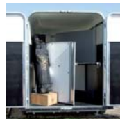
REAR STORAGE PARTITION